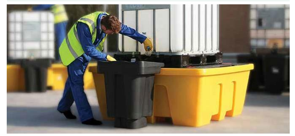
Application image for illustration purposes only. Additional items shown are not included. Color is as image shown at the top of the page.