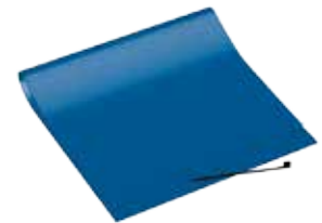
2 x Waste Bag

This Neoprene Drain Cover is 1/16th thick and ideal for covering close by man holes or drains that may be in danger of the spill present.