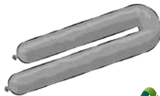
2 x Socks size 3" x 4'

The pads in this spill kit are Universal meltblown sonic bonded polypropylene and will absorb both oil- and water-based fluids at the same time.